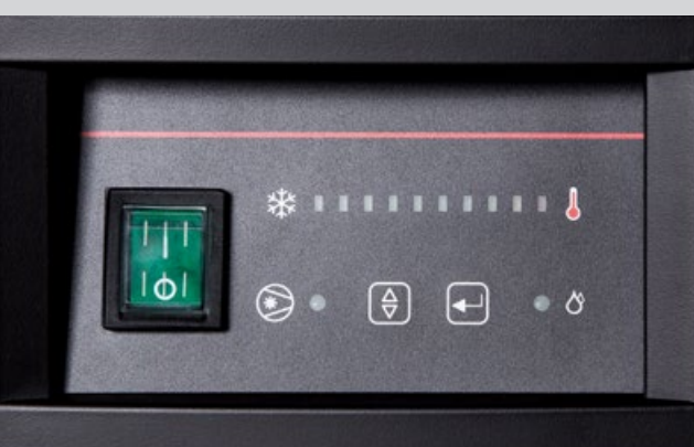
Controls: Models 200-1200 scfm