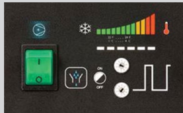
Controls: Models 200-400 scfm