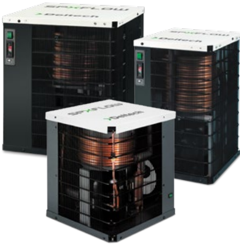
Efficient Smooth Copper Heat Exchangers

Customers around the world have relied on Deltech for great value in air treatment solutions. Deltech Value Line Refrigerated Dryers offer a simple solution based on a long history of industry leading technology.