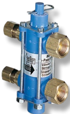
Air Bypass Valve